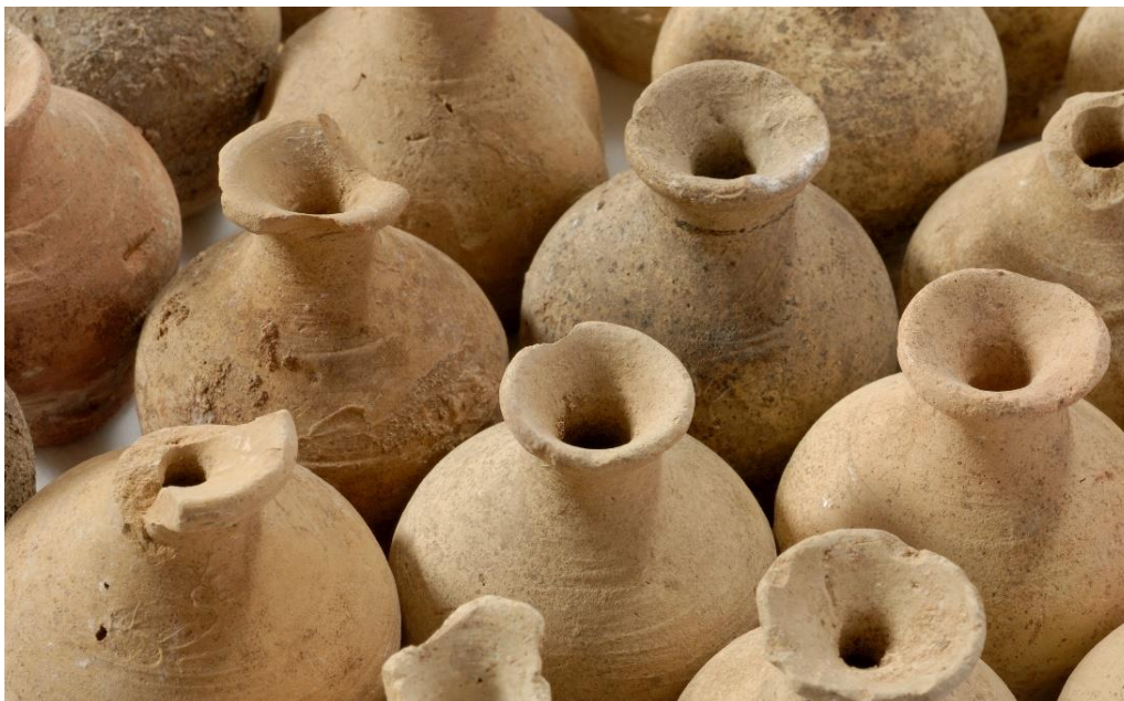
Figure 2. The small ceramic receptacles from the old Born market (Barcelona).

the construction of the military fortress. These artefacts had been published in the Drogues, dolços i tabac. Barcelona 1700 book (Garcia Espuche et al., 2010) and interpreted as small receptacles to sell products in little quantities because their capacity is about 25/30 ml. However, Beltrán de Heredia (2010) raises the possibility that they are incendiary hand grenades based on artefacts of similar shape and dimensions that have been considered as such.