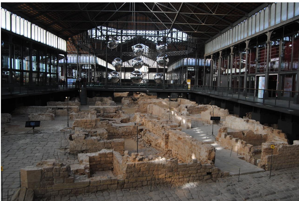
Figure 1. Photograph of the interior of the Born Cultural Centre, Barcelona.