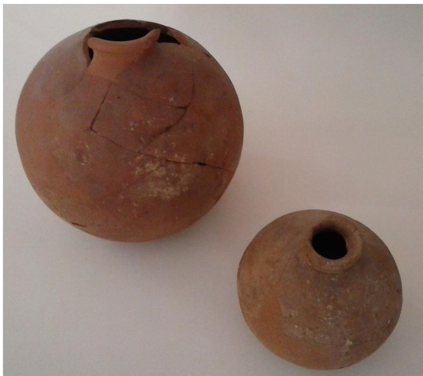
Figure 3. The ceramic grenades from the Priamar fortress (Savona)

Regarding the archaeometric study, the chemical (XRF) and petrographic (OM) analyses have showed that the Born grenades form a homogeneous production made using a calcareous (24.82% CaO) clay (Di Febo, 2016, Madrid Fernández et al., 2015). The optical observation by thin section showed a calcareous matrix, moderately oxidized and vitrified. The fine grained fraction (< 100 µm) is very abundant and formed by frequent calcareous microfossils partially dissociated due to relatively high temperature firing and micas which predominant on quartz, feldspar and micro-crystalline iron oxides. Very scarce coarser inclusions (about 400 µm, in few cases more than 1mm) are formed by fragments of mica schist and undetermined bioclasts due to firing process (Figure 4). Secondary carbonates filling vacuoles are also observed. The fine fabric, the carbonate-rich composition and the presence of calcareous micro- and macrofossils point to the use of poorly modified marine sediments (Di Febo, 2016) well compatible with the Pliocene marls diffused in the Barcelona area (Riba and Colombo, 2009, Ventayol et al., 2002). Considering the type of clay normally used for making fire pots, one might expect non-calcareous clays in the production of these grenades. In this case, the use of calcareous clays might suggest that grenades had been manufactured with raw materials not deliberately selected and available during the Bourbon military siege.